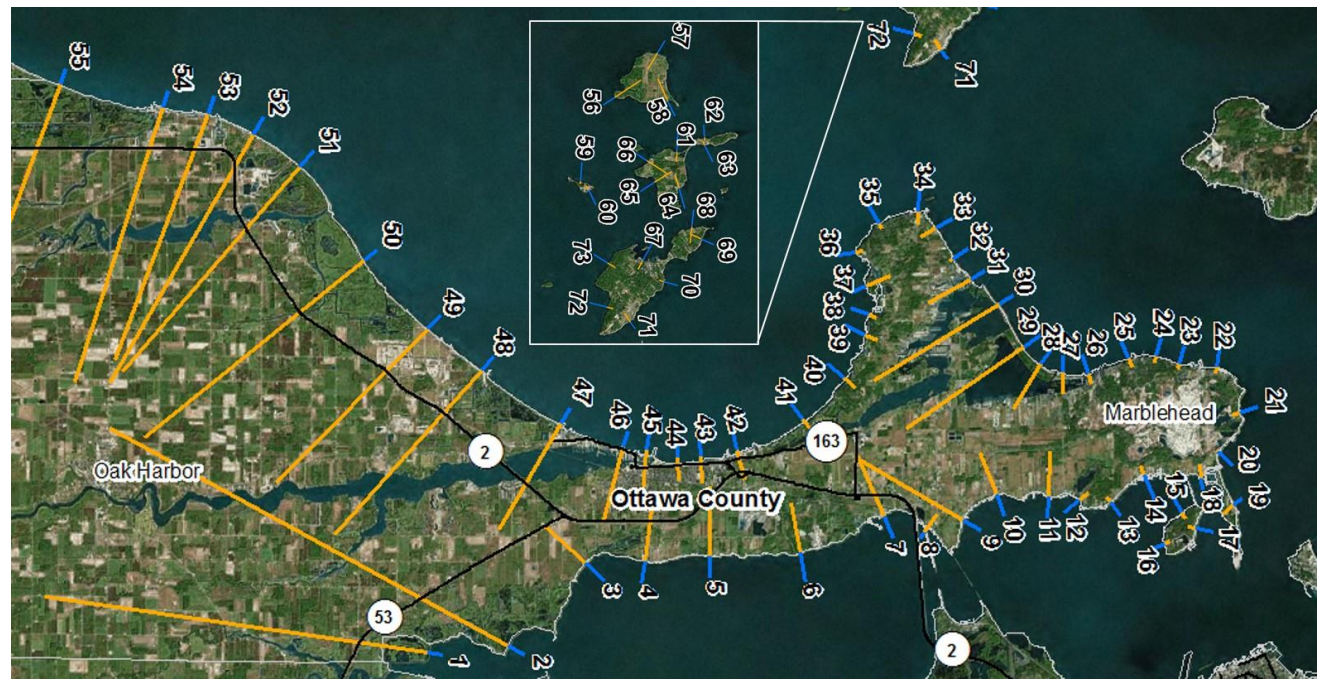
Aerial Transect Location