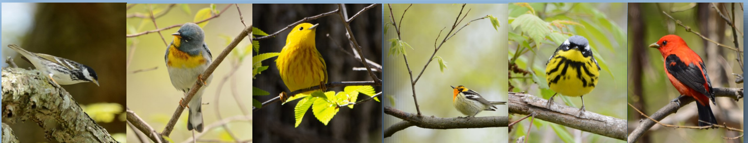
Left to right: Blackpoll Warbler, Northern Parula, Yellow Warbler, Blackburnian Warbler, Magnolia Warbler, Scarlet Tanager

Meadowbrook Marsh 8577 E. Bayshore Road in Danbury Township